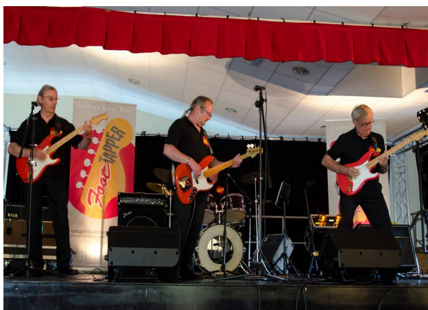
At Badonviller on 27 June 2015