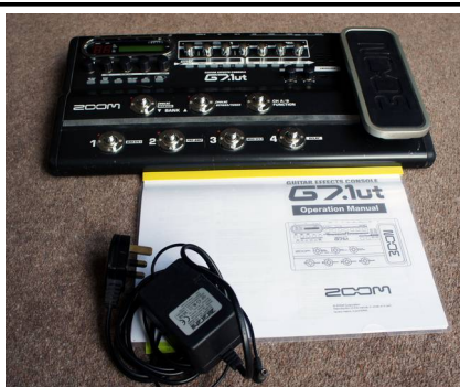
Pedal board & PSU

With Zoom's 32-bit ZFX-3 chip, the G7.1ut guarantees outstanding performance, world's fastest patch changes, and smooth and detailed processing.