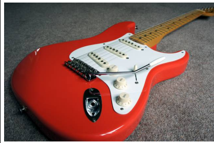
Fender Special Edition 50's Stratocaster