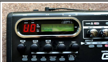
Close up of display